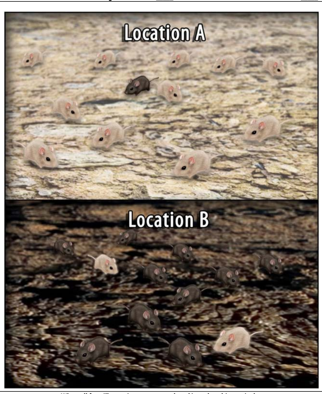
When all four illustration pages are placed in order, this one is the first (oldest) second third fourth (most recent). (Circle the appropriate number.)