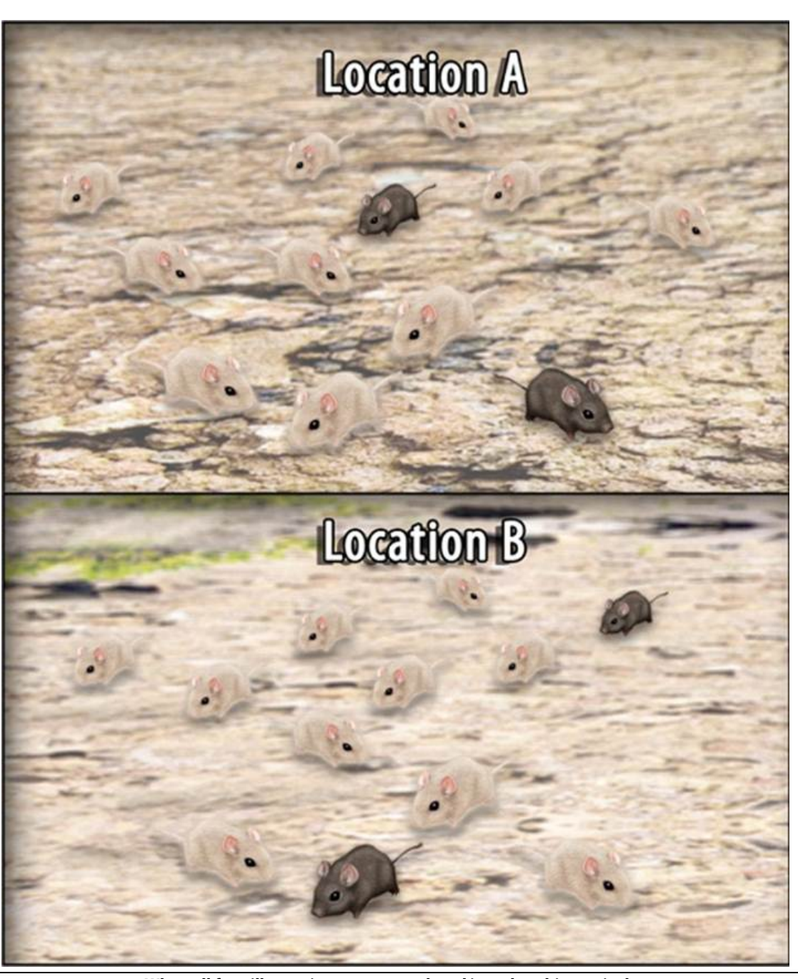
When all four illustration pages are placed in order, this one is the first (oldest) second third fourth (most recent). (Circle the appropriate number.)